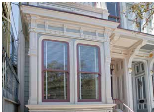
New windows add many benefits to your home.

the following guide to introduce you to the pros and cons of the many options—and, of course, Gina would be pleased to provide you with a free personal consultation.