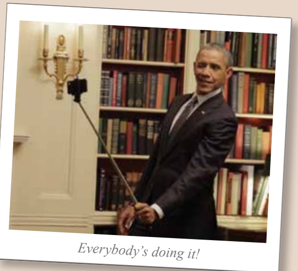
Everybody's doing it!

Do you yourself have any particular feeling about selfies? Maybe you post a selfie to social media to show off your outfit every night before hitting the club. Ever the pragmatist, perhaps you enlist the use of a selfie only on remotely rugged hikes with your dog, when no one else is around