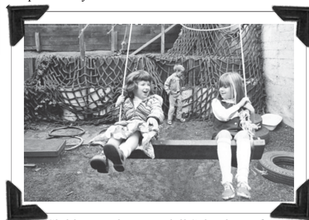
Children at the Rivendell School, our first community partner, enjoy the swings in what is now our Cole Street backyard nursery.

This year marks the 21st anniversary of our Community Partners Assistance Program, established to aid the fund-raising efforts of local schools and community-based nonprofit organizations that work hard to make the Bay Area the unique place that it is. We're thrilled that we now have more than 600 organizations and schools participating in our program. COLE HARDWARE is sympathetic to the inadequacy of government funding available to schools and worthwhile social causes, and at the same time, we realize the importance of social responsibility of businesses of all sizes.