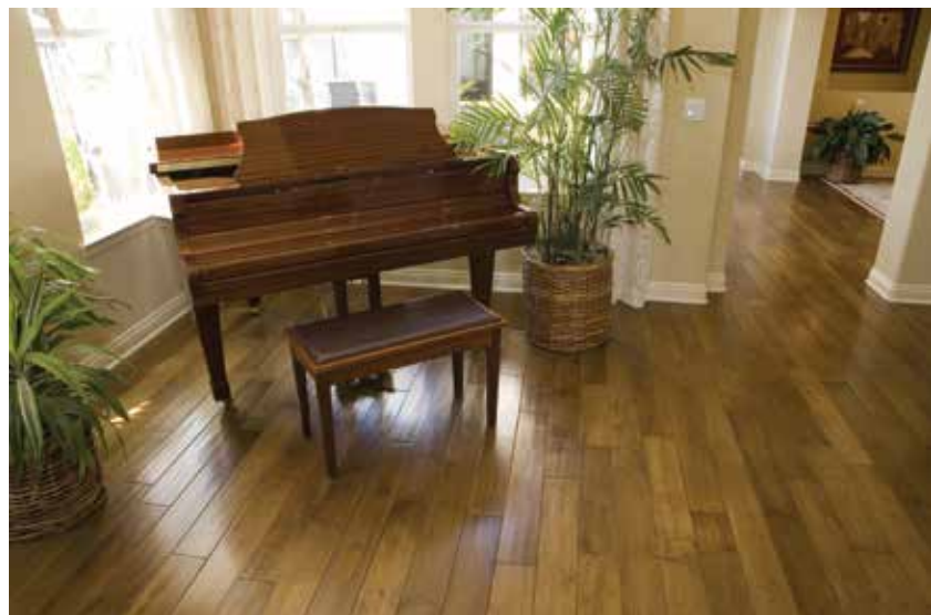
New flooring can transform a home.

To choose the option that works best for your home and budget, or if you have questions and would like an expert opinion, please call 415/753-2653 ext. 3 , or e-mail homerepair@colehardware.com , and we'll put you in touch with one of the flooring experts in our Repair Referral Service.