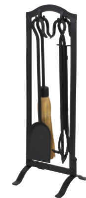
Five-Piece Tool Set (Sku 4161741, $31.99)