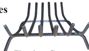
Fireplace Grate (Sku 49158, $29.99)

Visit any of our stores for fireplace accessories including screens, tool sets, and grates.