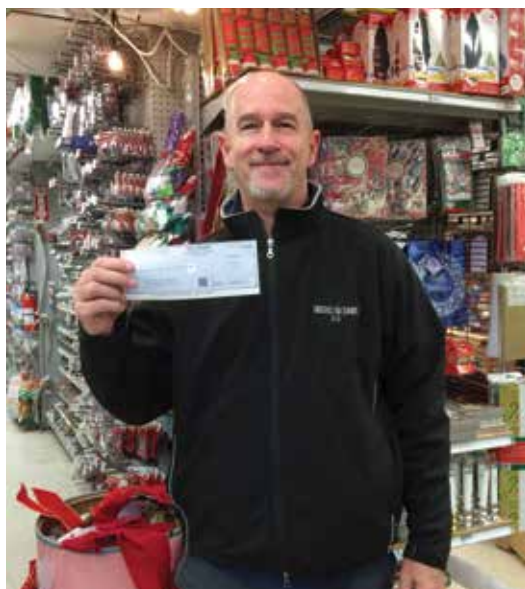
Tim with Groceries for Seniors accepts our Spare Change donation of $762.72.

It's easy to donate! Just drop your change in the collection jars at all of our cash registers—or bring in that jar of coins that is collecting dust on your dresser.