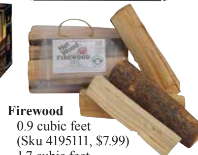
Firewood 0.9 cubic feet (Sku 4195111, $7.99) 1.7 cubic feet (Sku 900811, $18.99)