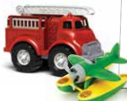
Thank you, Green Toys for your generous donation!